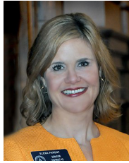
SENATOR ELENA PARENT (D-42)

State Senator Elena Parent was elected to the State Senate in 2014. She represents District 42, which includes portions of central and north DeKalb County.